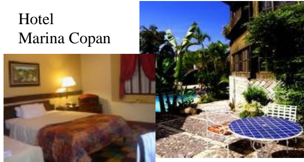
Hotel Marina Copan

Early morning departure for the Mayan ruins at Copan. Stay two nights in the heart of the charming village of Copan ruins. On arrival day lunch is followed by a guided tour of the archaeological ruins. Enjoy a free second day in Copan to explore independently. Overnight: B L